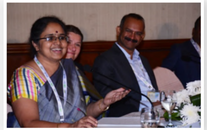
Human Rights: A critical component in Responsible Business Practices