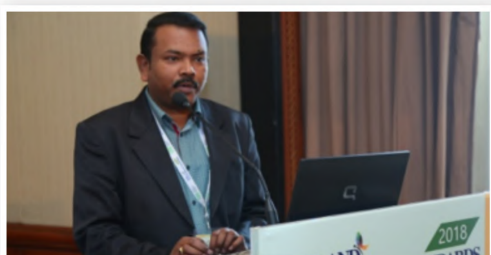
Responsible Sourcing and Implication on Communities