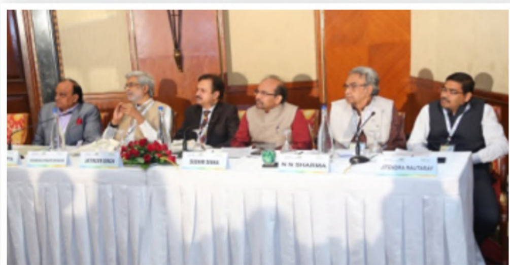
Futureproofing CSR in India - a forward looking approach