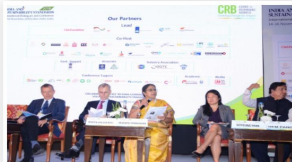
High level Panel: Cooperation Among and Across Governments: Linking the Global Goals with the Local Challenges