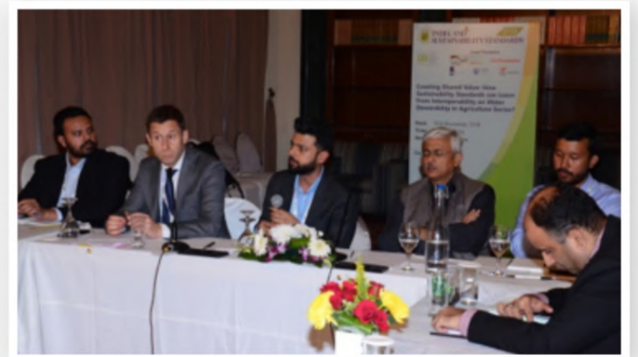
Creating Shared Value: How Sustainability Standards can learn from interoperability on water stewardship in Agriculture Sector?