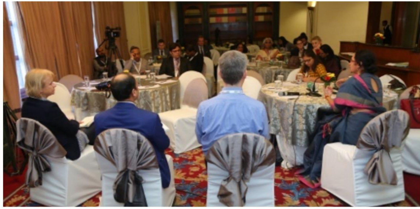
Sustainability Education in B-Schools – the Way Forward