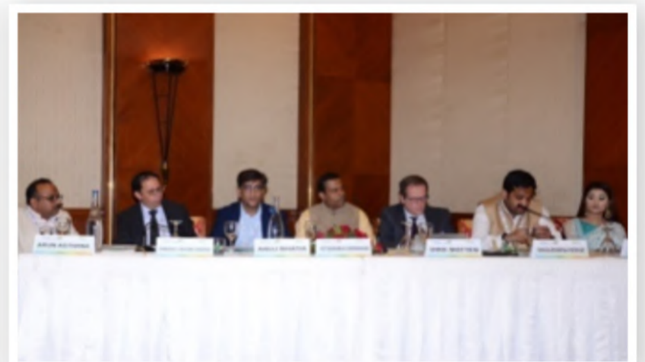
Create Value and Reap Benefits of Doing Good - A Workshop on Aligning CSR with SDGs, NDCs and help develop more Responsible Brands