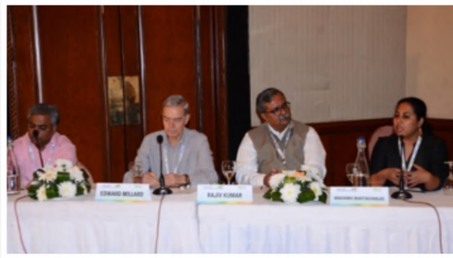
Collaboration for Sustainable Landscapes