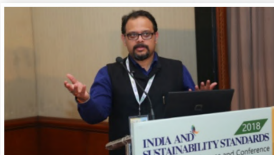
Making effective and trustworthy sustainability claims: Guidelines for