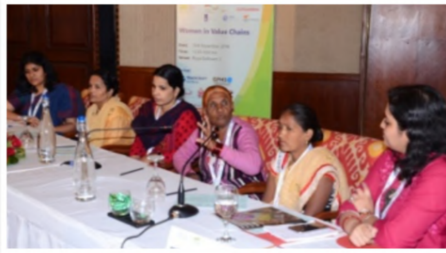
Women in Value Chains