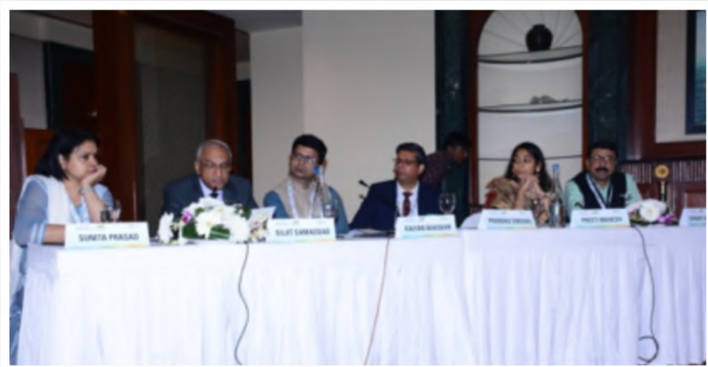
Measuring Impacts: Electronic Waste Management and the Sustainable Development Goals in India