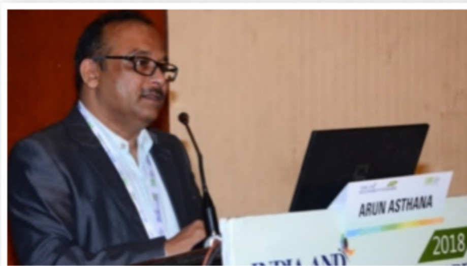
Leveraging Social Responsibility to Manage Strategic Risks