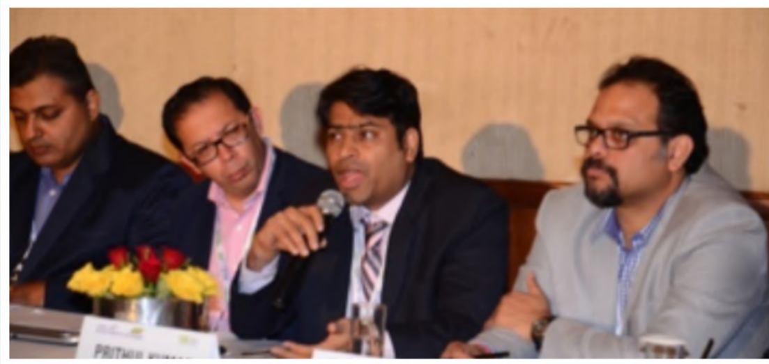
National Consultation: District Mineral Foundations (DMFs) as enablers of Sustainable Development in Mining Communities