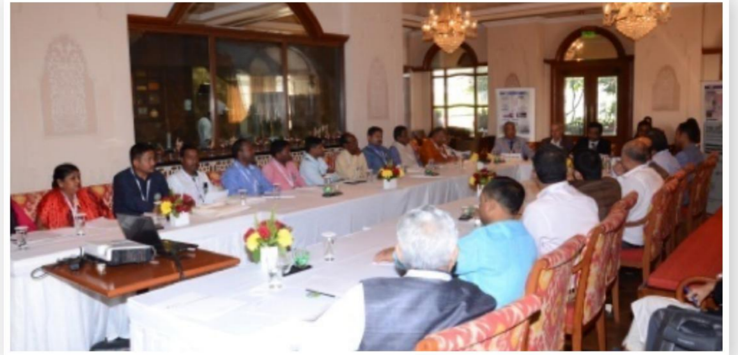
Promoting responsible business practices in small tea plantations and the supply chain: Findings solutions through Multi-Actor Working Group