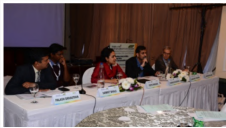
Deforestation and Sustainable Supply Chains in India