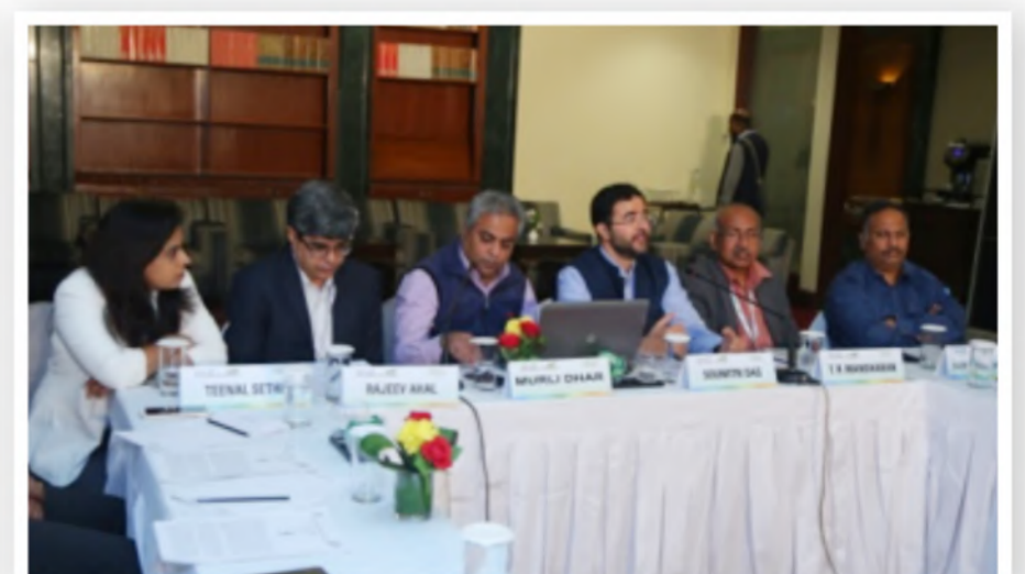
Climate Smart Agriculture: Ramping up agroforestry in India