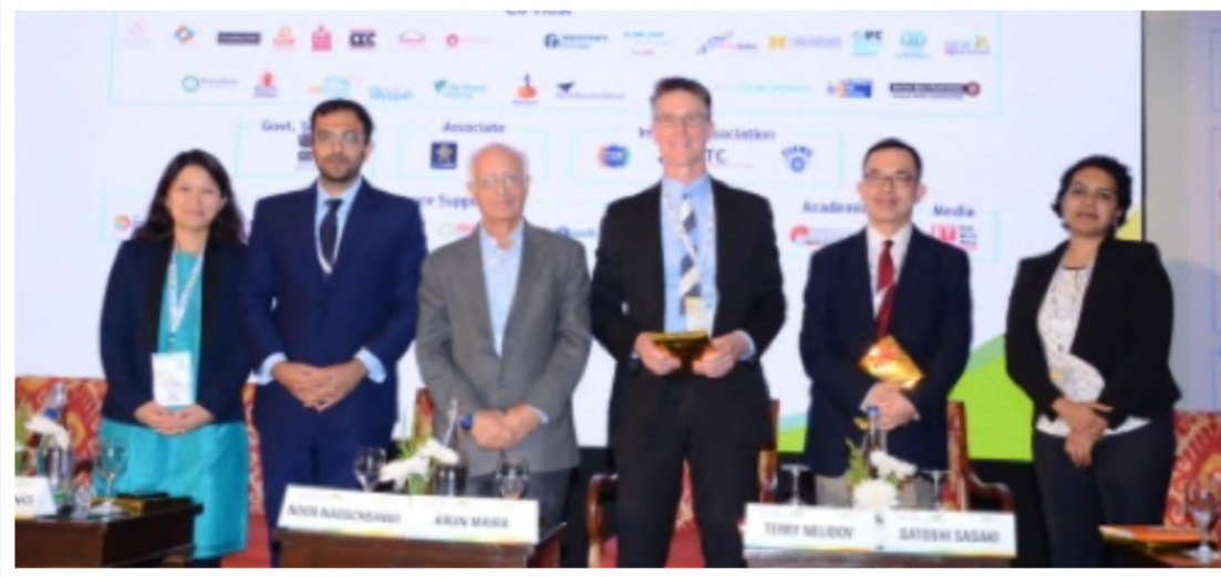
High level Panel: How to Make Multi-stakeholder Partnerships Work to Achieve SDGs