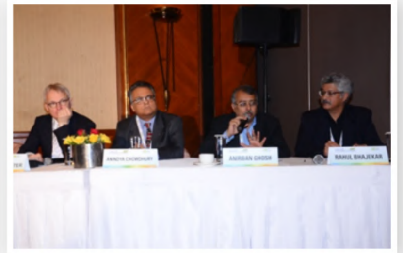
India Inc. & the water-energy-food nexus