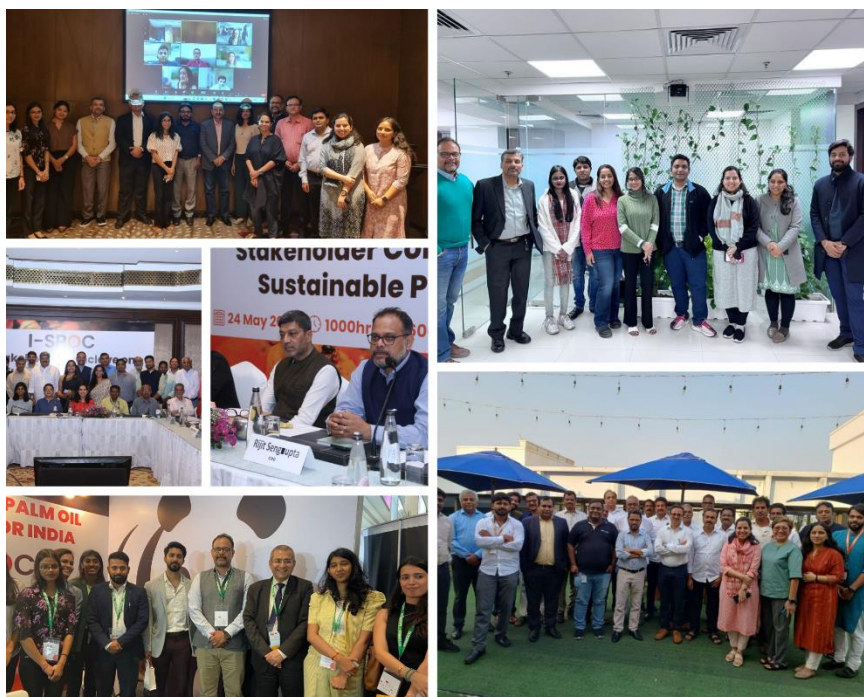
Picture collage of I-SPOC events from 2022-23 that were covered on I-SPOC LinkedIn page