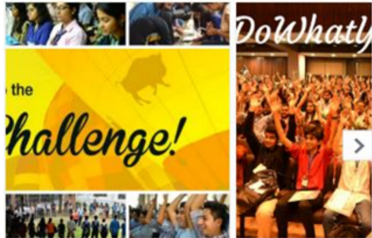
Young India Challenge |

Enriching experience, designing&developing ideas & unlimited fun awaits!... See more