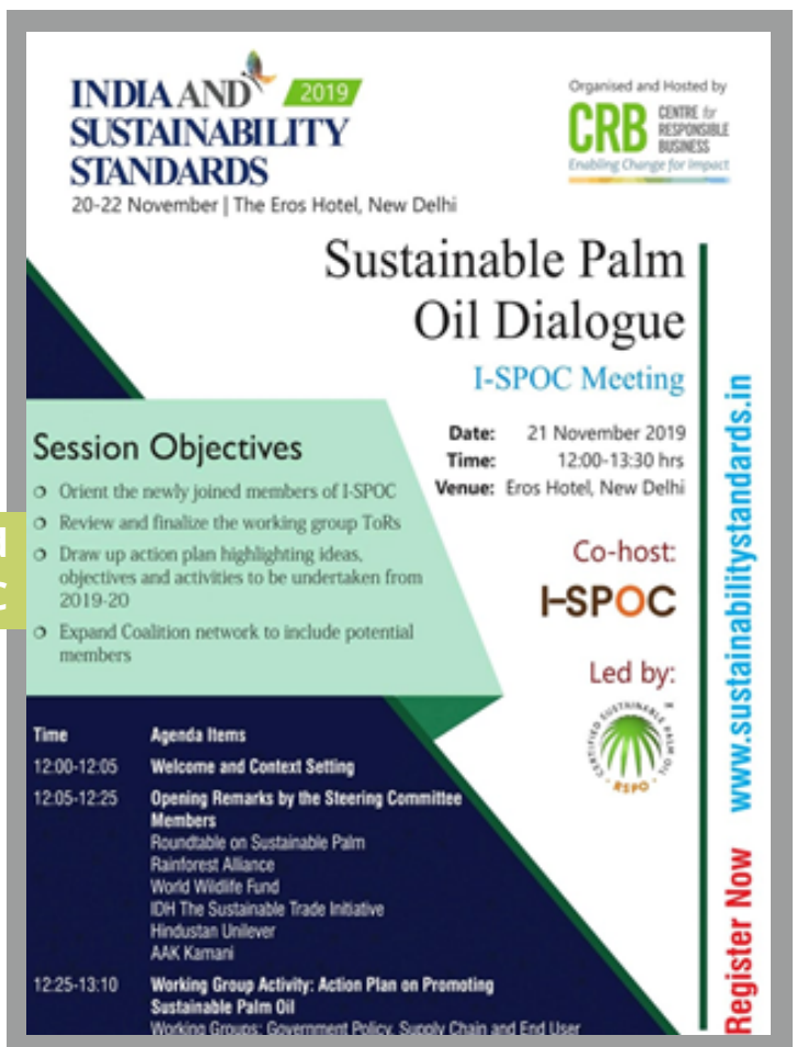
Figure 2: Poster for Second Members' Meeting of I-SPOC