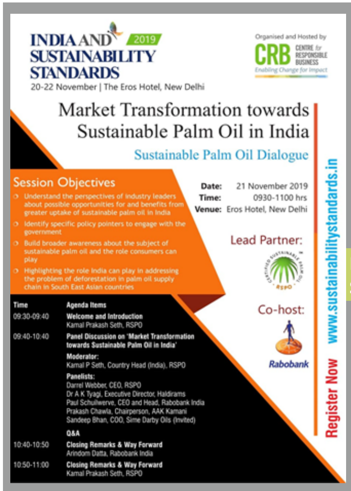
Figure 1: Flyer for session on Sustainable Palm Oil Dialogue