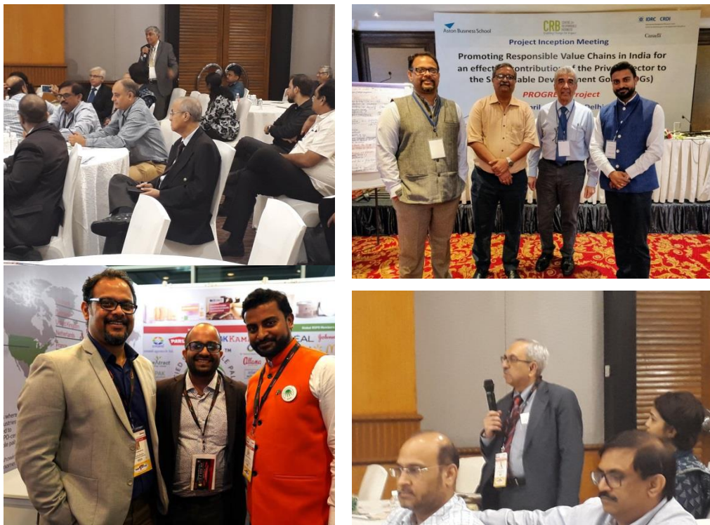
CRB and RSPO participated in a number of events to raise the awareness/understanding on sustainable palm oil