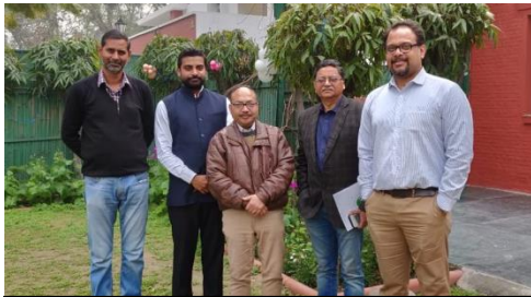
In a meeting with senior journalists in Delhi, Feb 2019

While some of these discussions were undertaken one on one, some others were held in groups of 3-4 journalists at a time.